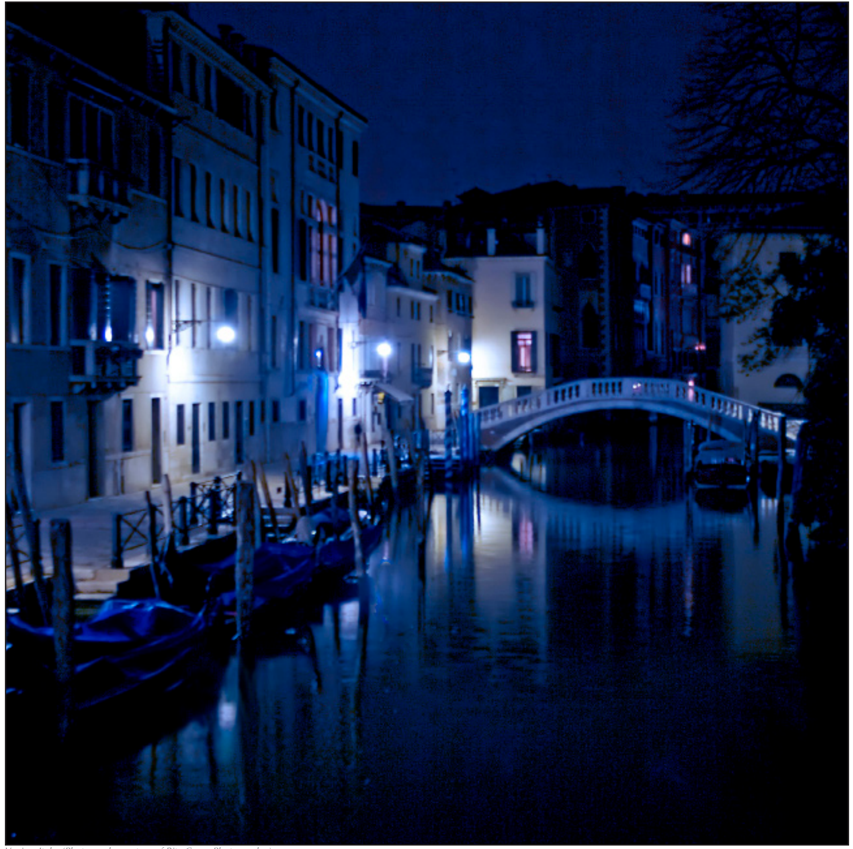
Venice, Italy.